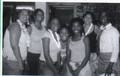
Members of I.M.A.G.E. at a luau held in August with ProgressiveBlack Men, Inc.

In Movement Against General Eyedeals, or I.M.A.G.E., founded summer 2004, a student run organization, has two main goals: to educate the student body about issues affecting