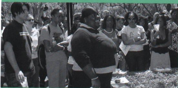
Students participating in protest against Alligator.