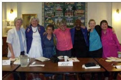
Members of the historic panel gather before the discussion.

Sponsored by the Samuel Proctor Oral History Program, and co-sponsored by the Center for Women's Studies and Gender Research along with many other UF and community centers, the panel discussion gathered local