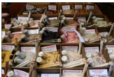
Different Varieties of Salt in Nice, France.

I spent the Spring 2010 semester in Paris, France as a Visiting Scholar at l’École des hautes études en sciences sociales (EHESS) and as a scholar in residence at the UF Paris Research Center. My project was to research Slow Food activities in Paris’ Bastille neighborhood (10 th arrondissement).