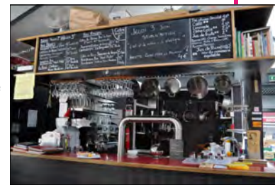
Cafe de la Commune Libre d’Aligre (Slow Food Cafe where student’s conducted their service-learning projects)

component at the Slow Food Café in Bastille in order to situate the theoretical readings from class in a real-life context. We were also able to visit a woman-owned vineyard in the South of France (Provence) and local/organic markets in Nice.