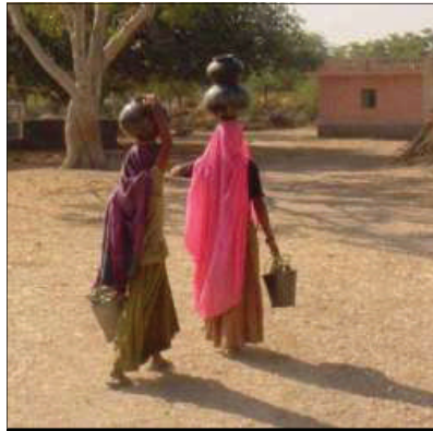
"Thousands have lived without love, not one without water" W.H. Auden