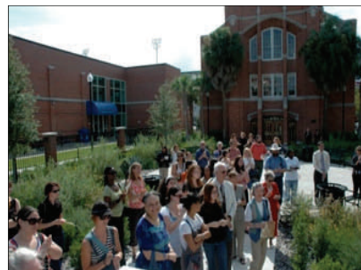
A large crowd gathers in front of Ustler Hall to witness the unveiling of the Yardley Garden Wall.